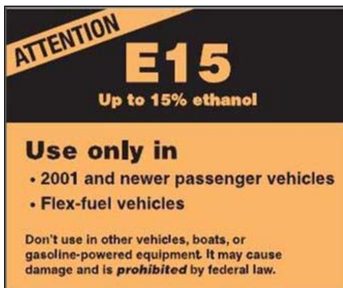
Figure 3. EPA's New Label for E15 Dispensers